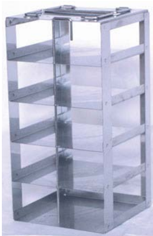
Chart manufactures a 5-level rack for 2-inch boxes. The 5-2 rack dimensions are 5.53" (14cm) L x 5.56" (14.1cm) W x 10.83" (27.5cm) OAH. The rack can be used in the Cryoshipper PN 10508967, Cryoshipper XC PN 11015195, MVE1842P-150 Freezer, and the IATA (International Air Transport Association) PN 10777411. However, the 5-2 rack may fit loosely in the Cryoshipper XC and IATA. This rack may be ordered using PN20969812