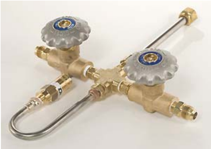
Figure 4 -- Tee Valve

Chart sells a tee valve assembly complete with a relief valve which enables multiple connections of supply tanks and/or freezers.